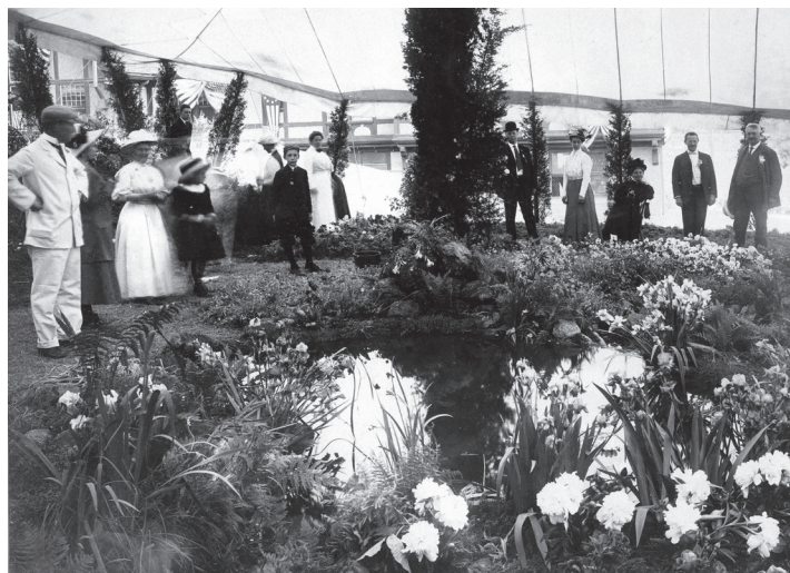
Belmont's Strawberry Festival in its heyday - a profusion of flowers graced the large tents where Belmontians in their finery enjoyed elaborate displays and contests followed by music and dancing.